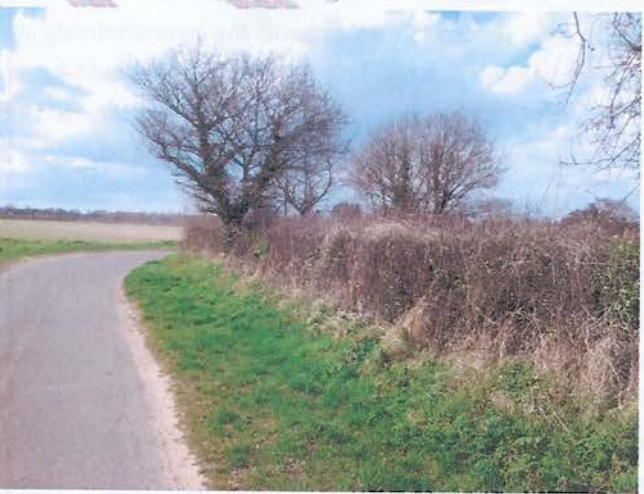
Photograph 4: Mill Lane (improvements proposed to forward visibility at this location)