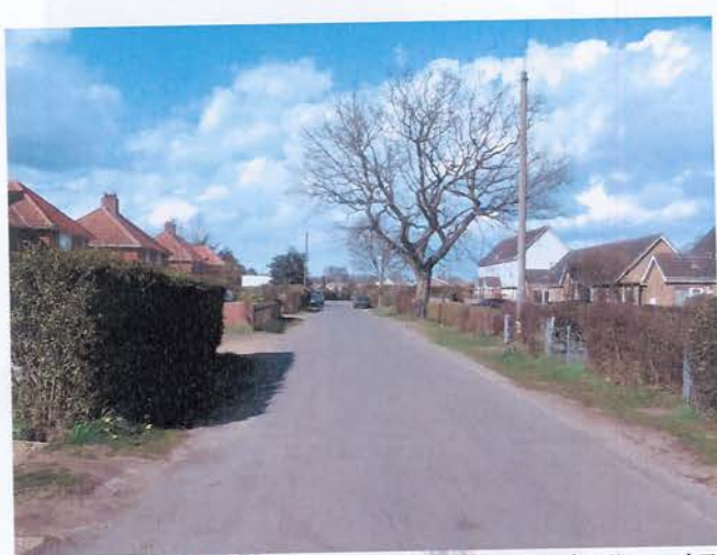
Photograph 2: Mill Lane (looking north towards the Mill Lane/Mill Road T-junction)

2.2 Florence Way (that would be extended to serve site 1174) connects to Mill Lane on the west side of the carriageway via a simple T-junction. Florence Way is a modern cul-de-sac with its estate road constructed to contemporary standards. The T-junction was constructed specifically for a new housing association scheme comprising 8 dwellings and granted planning consent circa 2003 (planning application ref: E07/03/2098F). The housing association scheme is now constructed and has been fully occupied for several years.