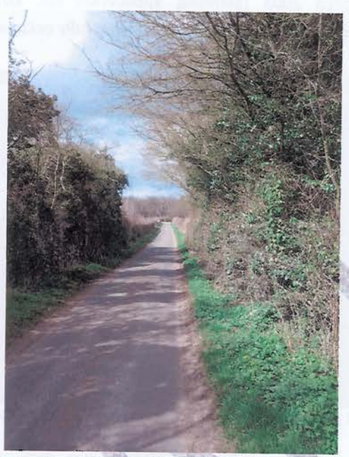
Photograph 3: Mill Lane ("rural section" looking west)

2.7 To the south of sites 309 and 301, Mill Road becomes essentially rural in character primarily serving surrounding agricultural fields. This "rural section" appears to have no particular strategic purpose for the distribution of general traffic locally and it appears to be subject to only minimal use - as is evident by the build up of silt along the crown of the road.