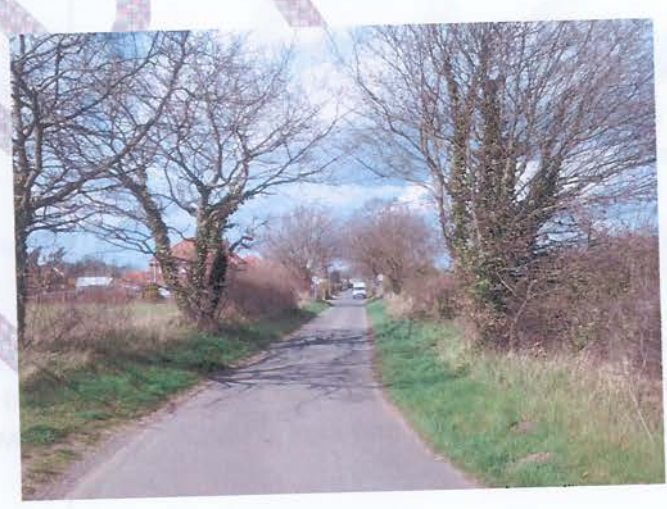
Photograph 1: Mill Lane (looking north from the southern extents of sites 309 and 310)

2.1 In the immediate vicinity of sites 309 and 310, Mill Lane is a rural single carriageway road narrowing to approximately 3.5m in width and is subject to the national speed limit. Immediately to the north, the road becomes subject to a 30mph village speed limit and is characterised by frontage residential development. Along this "village section" the road widens up to approximately 5.0m leading northwards to the Mill Road/Mill Lane T-junction.