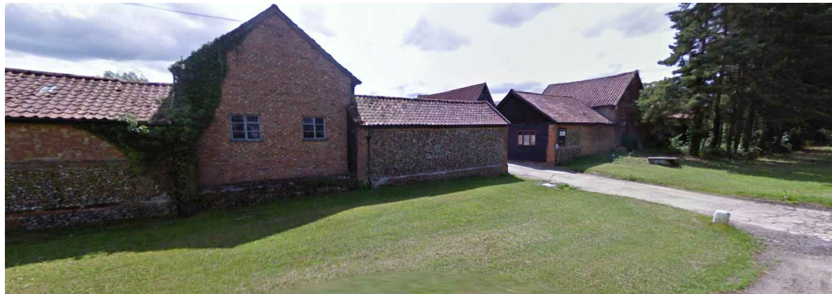
TYPOLOGY PRECEDENT - COURTYARD WITHIN CARLETON RODE