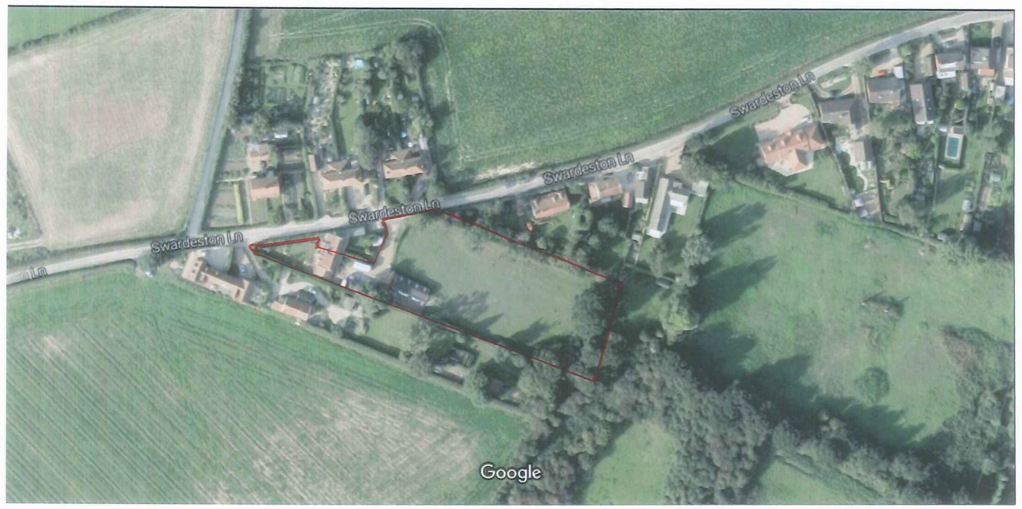
Imagery @2016 Getmapping plc, Map data @2016 Google 20 m

POTENTIAL SITE SUBMISSION FOR GREATER NORWICH LOCAL PLAN - R and A RHODES MAP TO SHOW CLOSE VIEW OF SITE-PADDOCK COTTAGE, SWARDESTON LANE, NR 14 8 LF = PADDOCK COTTAGE PROPERTY OUTLINED IN RED