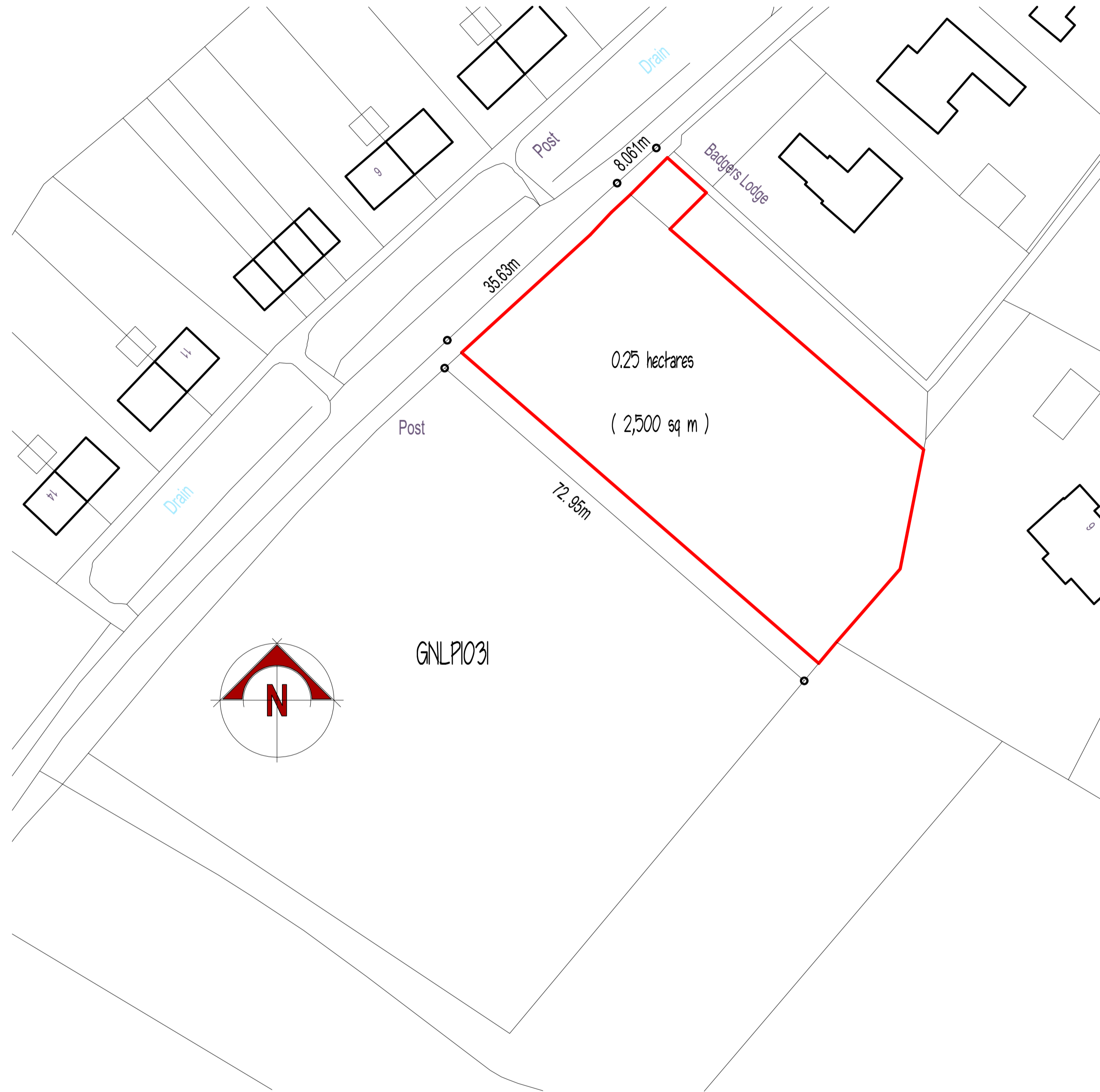
SITE LAYOUT 1:500