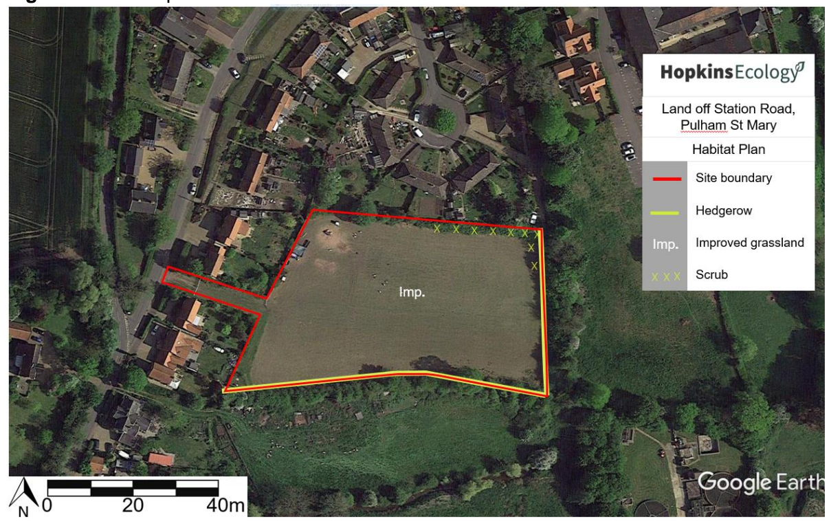
Figure 2. Habitat plan.

4.1 The Site (Figure 2) comprises a single field bounded by housing and gardens on two sides. The housing to the west dates from the late 1980s / early 1990s and the housing to the north is from between the post-war period and the late 1980s. In the 1940s the application Site therefore comprised part of a much larger field.