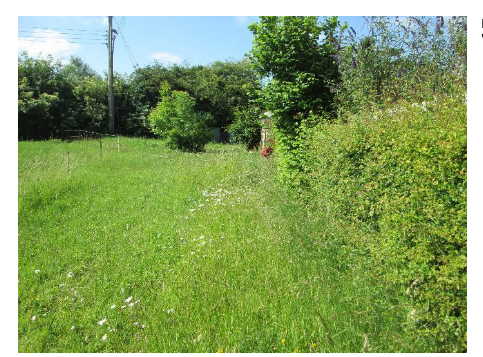
Figure 6. West boundary.