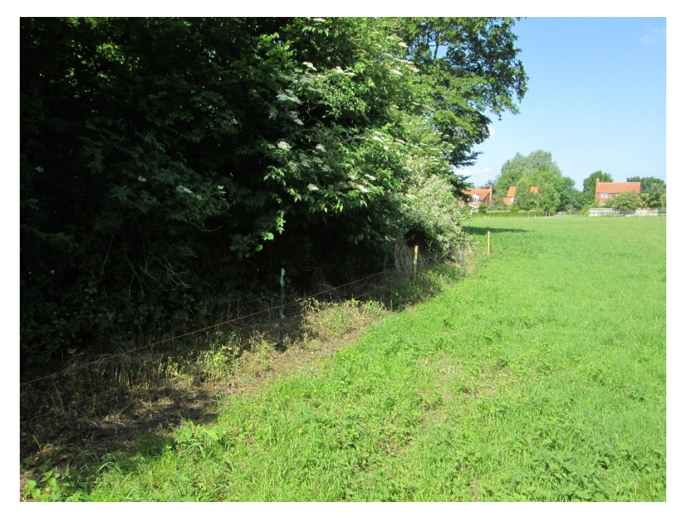
Figure 7. South boundary hedgerow, from eastern end.