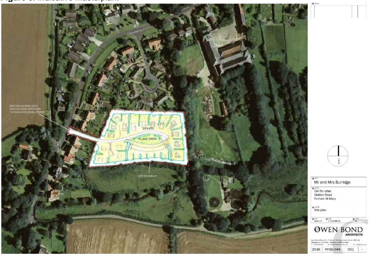
Figure 3. Indicative masterplan.