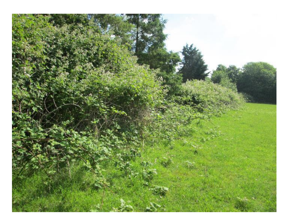
Figure 9. North boundary.