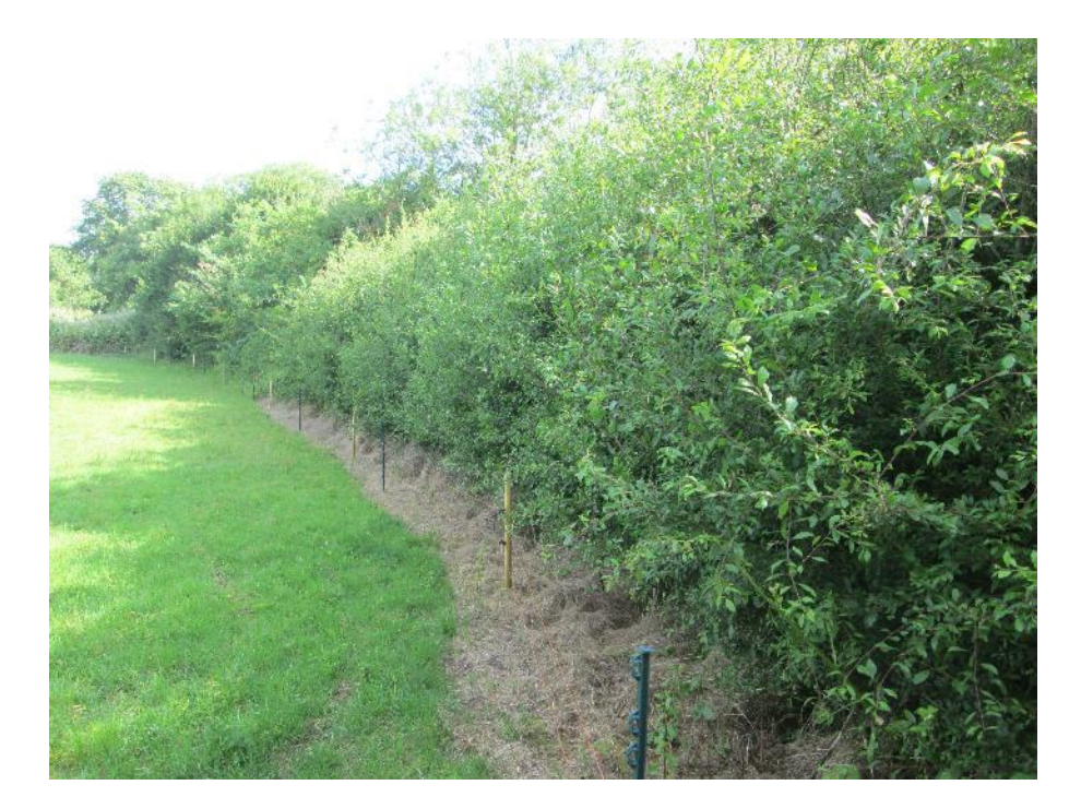
Figure 8. East boundary.