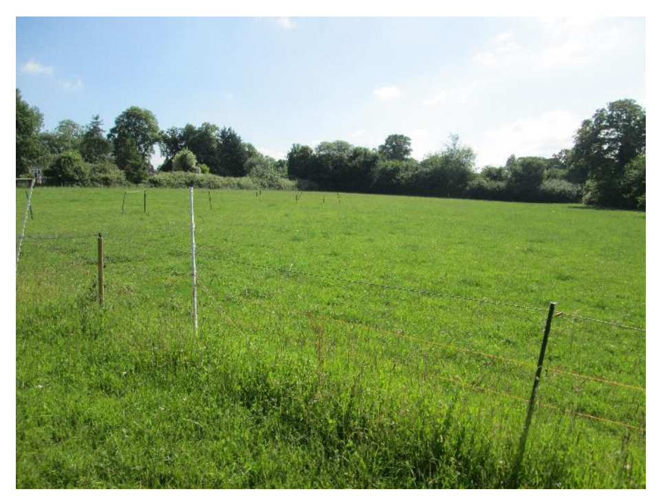
Figure 4. Main grassland area from southwest.