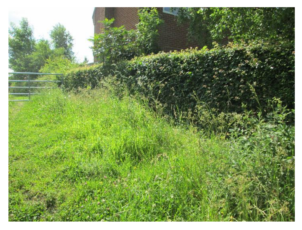
Figure 5. Entrance way along west boundary.