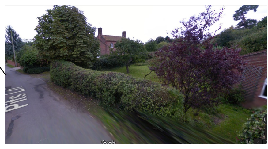
View South down Pits Lane, Old School house in background.