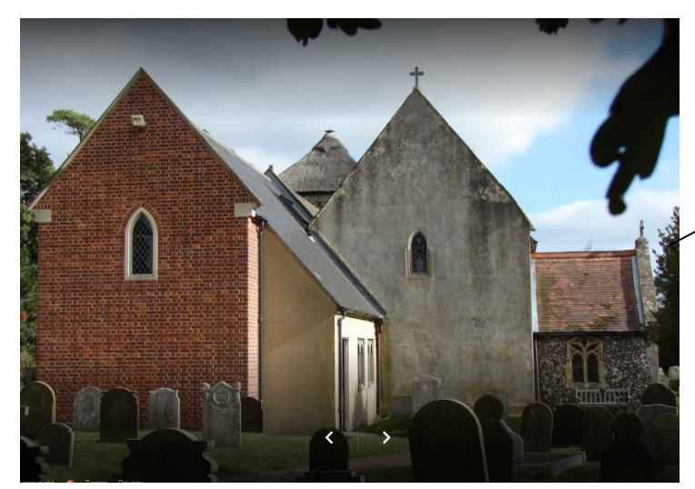
All Saints Church