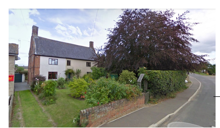
7& 9 Hardley Rd