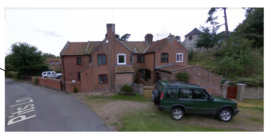
View South down Pits Lane, All Saints Church in background