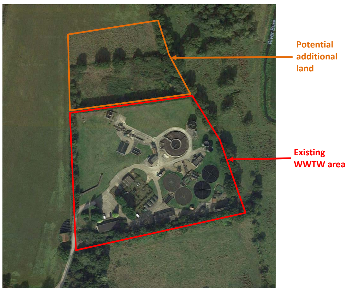
Figure 2.1. Existing/Available WWTW Land