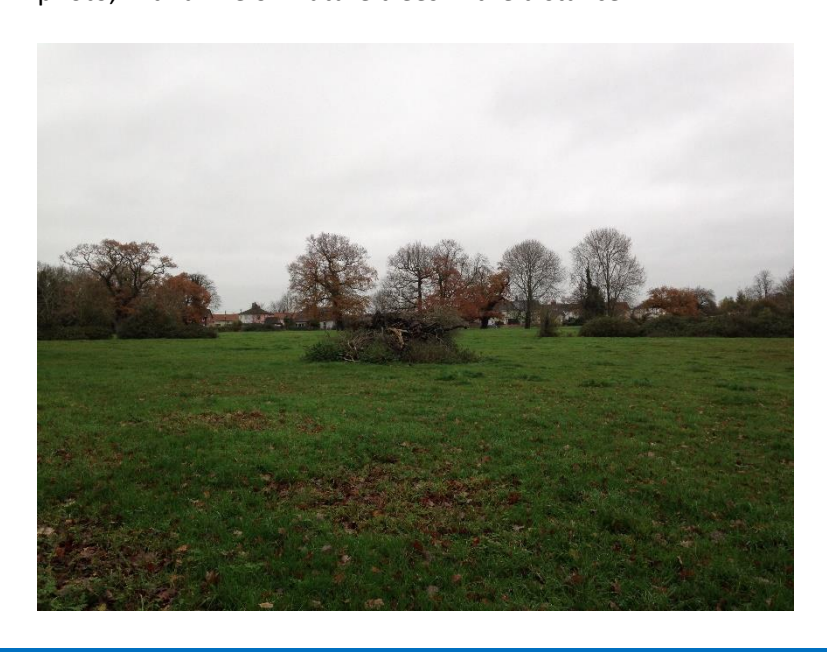
Target Note 2

Photograph showing poor semi-improved grassland in the foreground, which covers most of the site. A pile of woody debris is shown in the centre of the photo, with a line of mature trees in the distance.