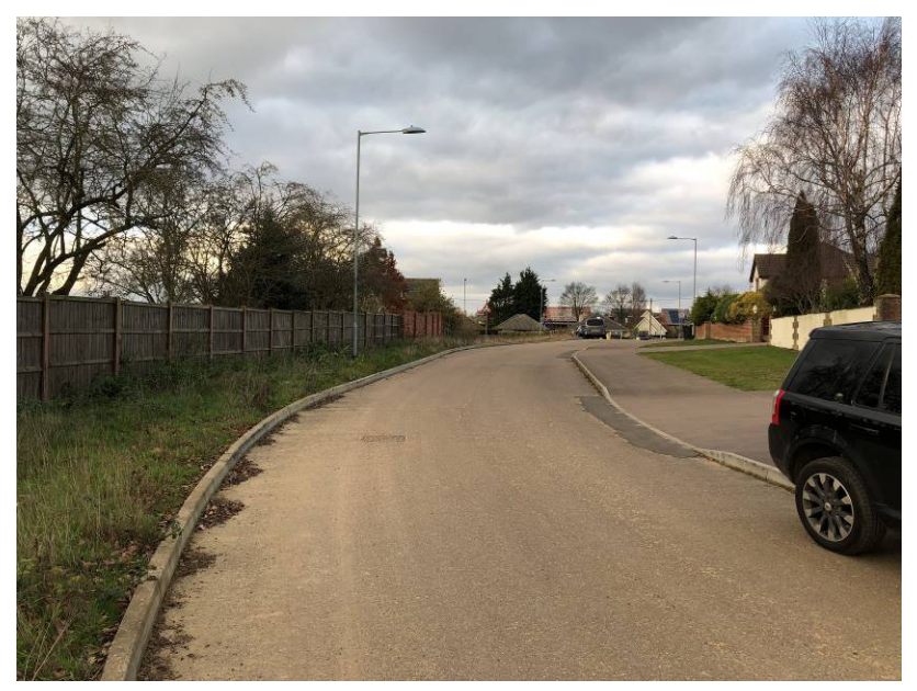
Photo 2: Looking North along The Ridings (indicative location of GNLP access to the left)

1.22 The trip generation associated with a development of circa 80 dwellings at this type of location with good access to local services and facilities and public transport has been estimated as part of this Technical Note.