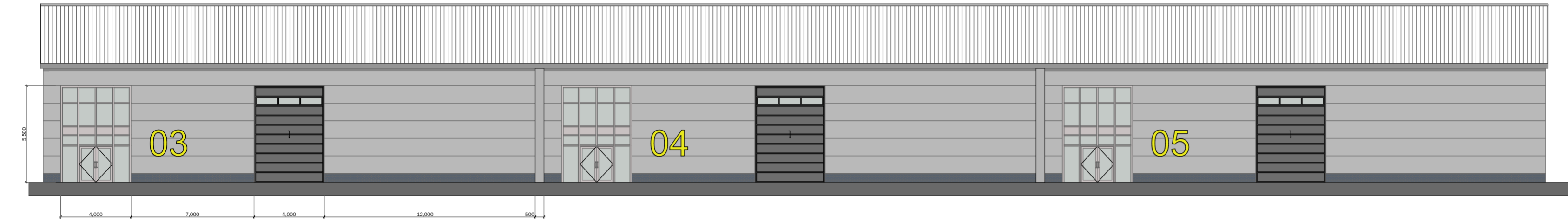
Unit 3 - 5 Elevation