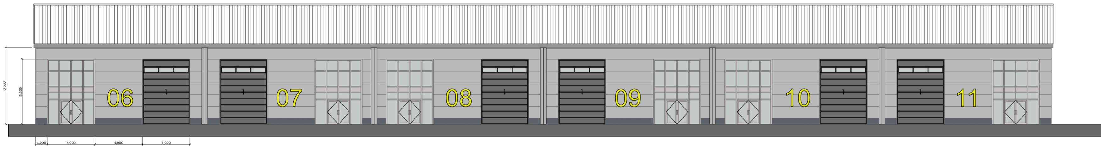
Unit 6 - 11 Elevation