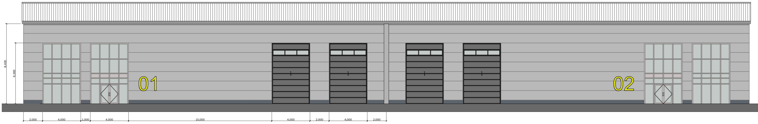
Unit 1 - 2 Elevation