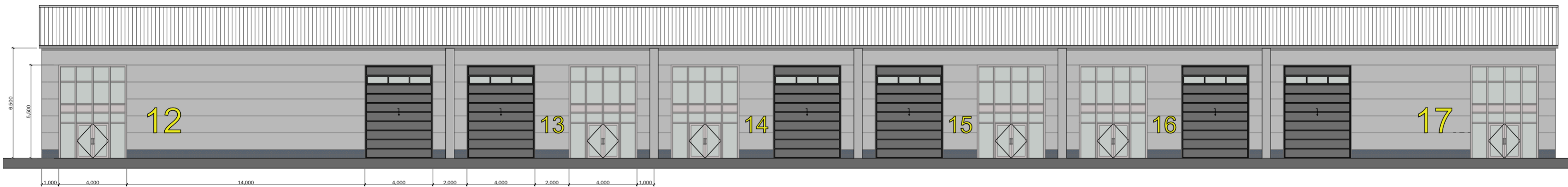
Unit 12 - 17 Elevation