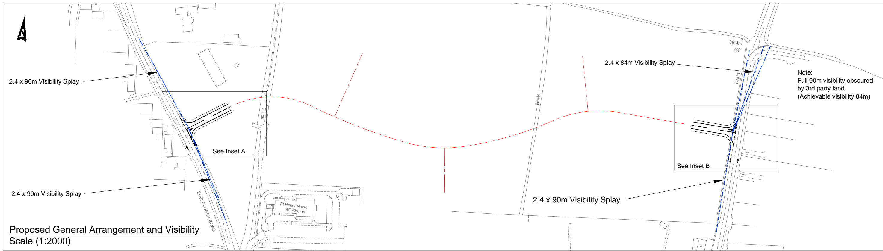
Proposed General Arrangement and Visibility Scale (1:2000)