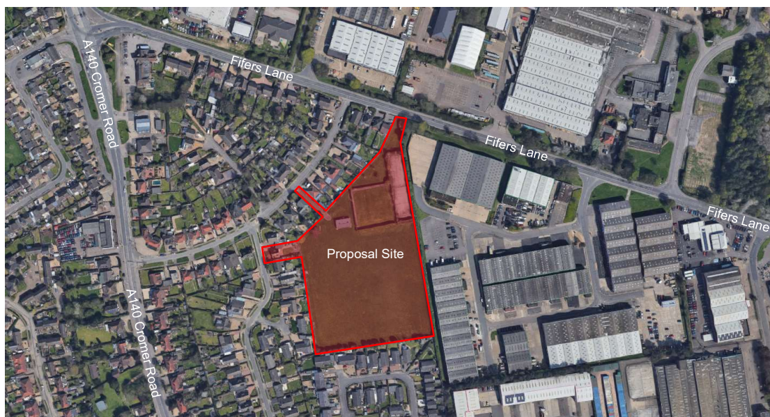
Figure 1 – Location of proposal site and surroundings

The location of the proposal site and surroundings are indicated in Figure 1.