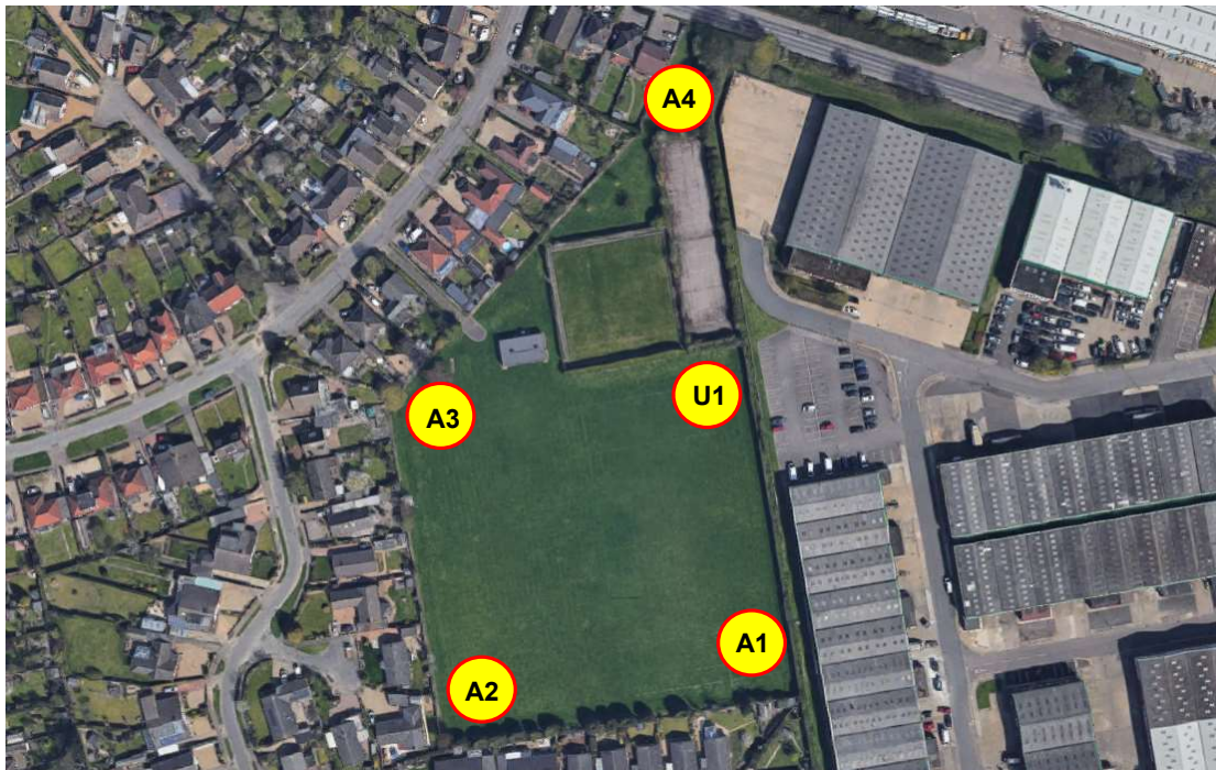
Figure 3: Locations of Measurement Positions © Google 2020

Unattended (U1) and attended measurement (A1-A4) positions are shown in Figure 3.